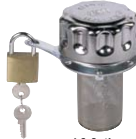
LC Option Locking Cap