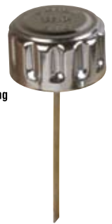
DIP Option Dipstick

Please supply drawing specifying lengths shown. Dipstick may be marked "FULL" and "ADD". Optional wording available.