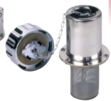
HN Option High Neck